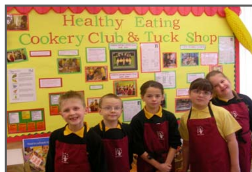
Some of the keen Cookery Club members