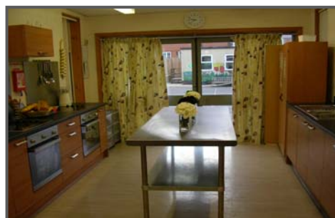
The newly refurbished kitchen – a superb resource within the school